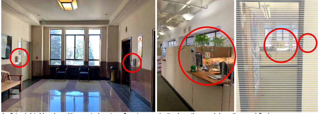
Left to right: Hand sanitizers at elevators & entrances/exits, breath guard, breath guard & signage.

One example of this work is at a city clinic. In the clinic setting, the Safety unit reconfigured the space to allow for employees to see clients in-person while maintaining client privacy and adequate physical distance, and provided guidelines on how to interact safely. For the past year, this work was the sole focus of the Safety unit, as an important component of the City's Emergency Operations Center (EOC). Moving forward, the Safety unit will continue to respond to changes in the pandemic and official (CDC and Cal OSHA) guidance.