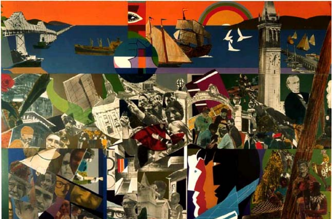
The City and Its People