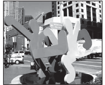
Untitled (Three Dancing Figures) , Keith Haring, 2001 (1989) Public Art for the City of San Francisco, CA.