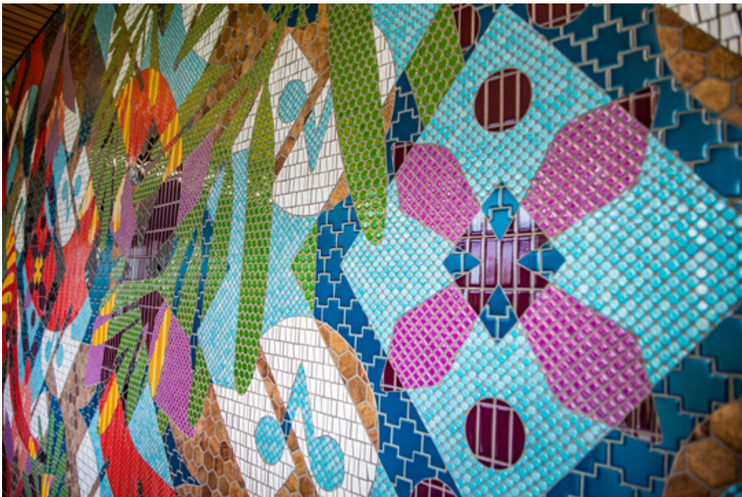
New Willard Clubhouse Mosaic Art - Enchanted Forest