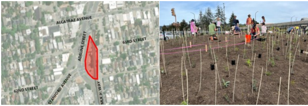
Adelline Street Landscape map area & Miyawaki Forest Tree Planting

Miyawaki Forest has been completed and construction for the dog park and landscape began in March 2026 and will take approximately 3 months to complete, depending on weather or unforeseen conditions. Standard work hours are 7:00 a.m. - 5:00 p.m., Monday – Friday.