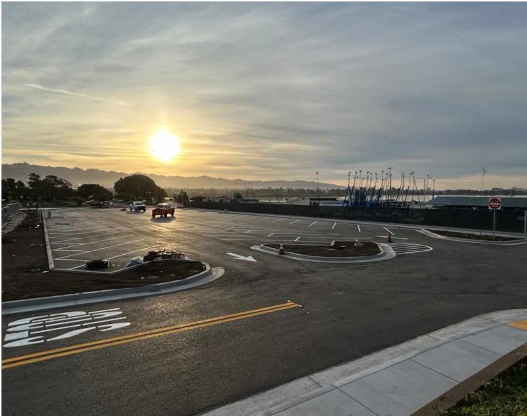
South Cove West Parking Lot Improvements

We look forward to celebrating these improvements with residents and visitors at the Berkeley Waterfront and continuing to enhance this special community space for all to enjoy. Please join us April 2, 2026, at 11 am at the South Cove West parking lot the for a ribbon cutting and light refreshments.