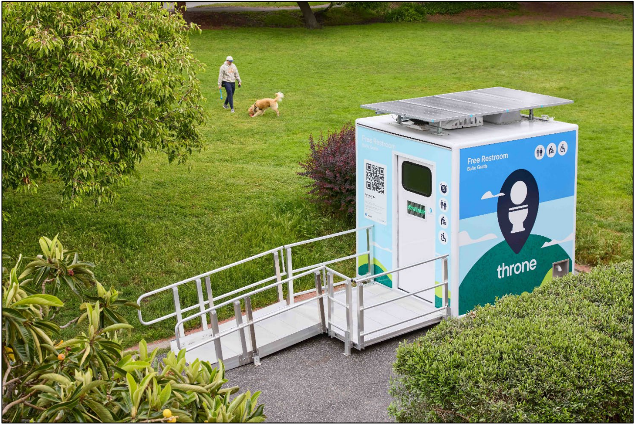
Throne unit at Strawberry Creek Park with solar power and ADA accessible ramp