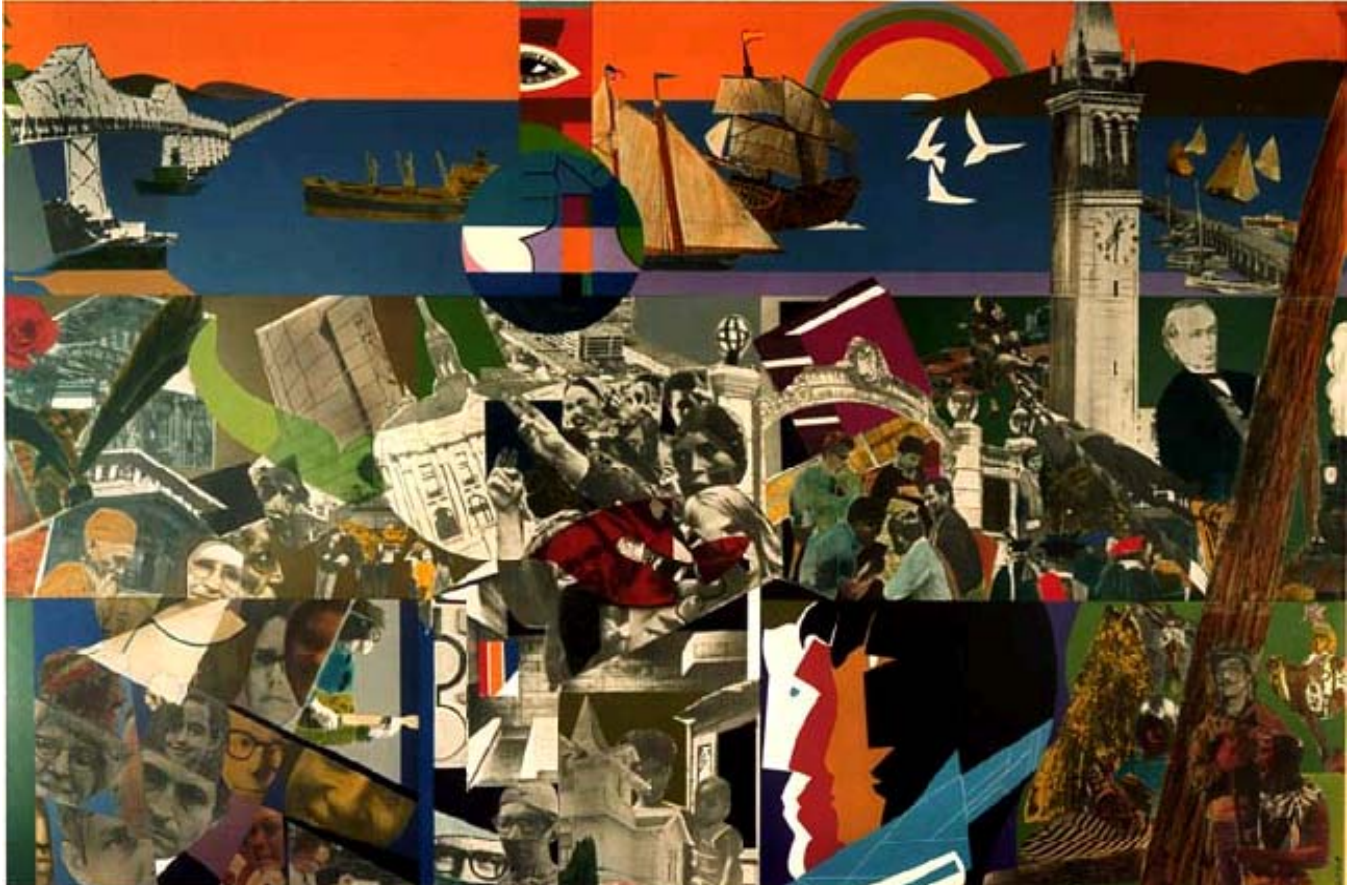
The City and Its People