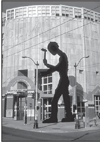
Hammering Man , Jonathan Borofsky, 1991. Public Art for the City of Seattle, WA.