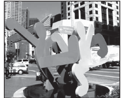
Untitled (Three Dancing Figures) , Keith Haring, 2001 (1989) Public Art for the City of San Francisco, CA.