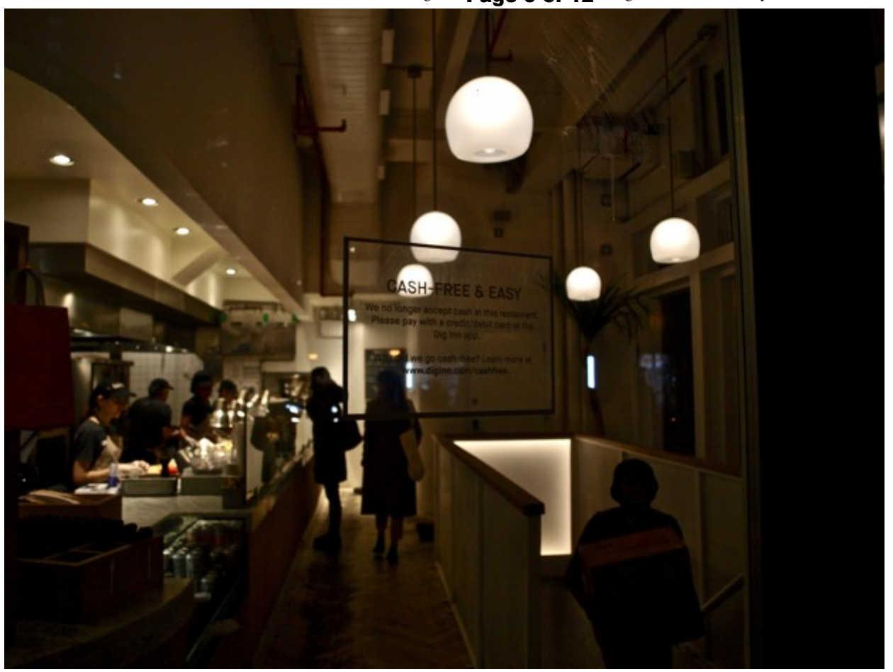
A sign on the door of a Dig Inn dining and take-out establishment in New York City.

A capitalist economy breeds wealth discrimination: Many of the cashless institutions in NYC are not moderately priced. Theoretically anyone can buy a $12 salad at Sweetgreen, one of the cashless pioneers, yet can they really? But the resulting exclusion of New Yorkers of color and the undocumented, based on their lack of a bank account, still counts as discrimination, according to Marie Napoli, a lawyer and civil rights advocate.