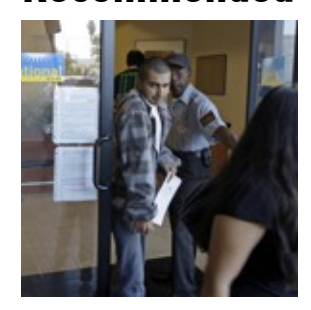
The Tax on Black and Brown Customers When Dealing With Community Banks BRENTIN MOCK / DAVID MONTGOMERY JUN 21, 2018