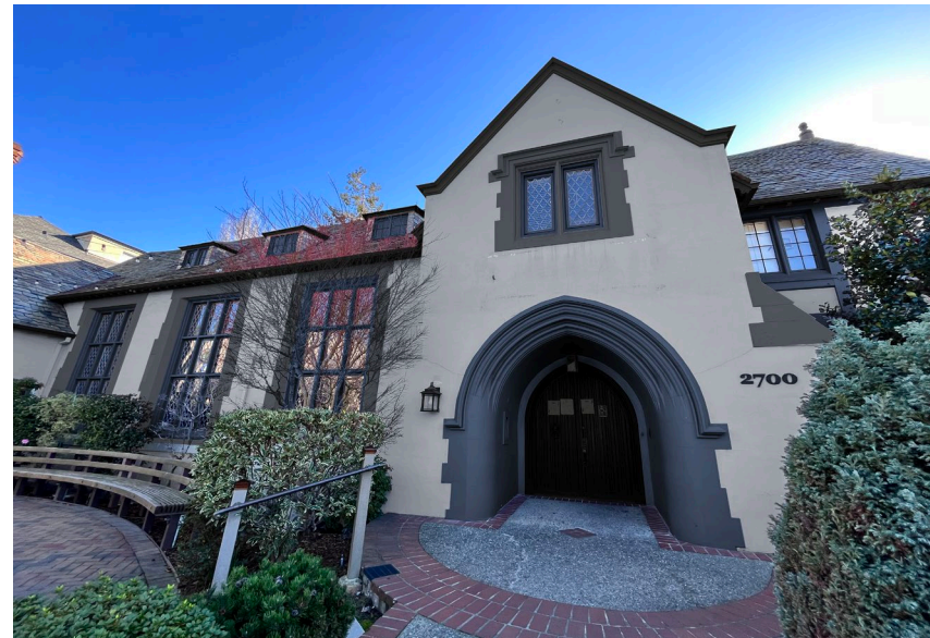
EXTERIOR STREET VIEW HERITAGE HOUSE SCHEME A