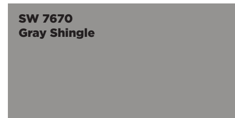
SW 7670 Gray Shingle