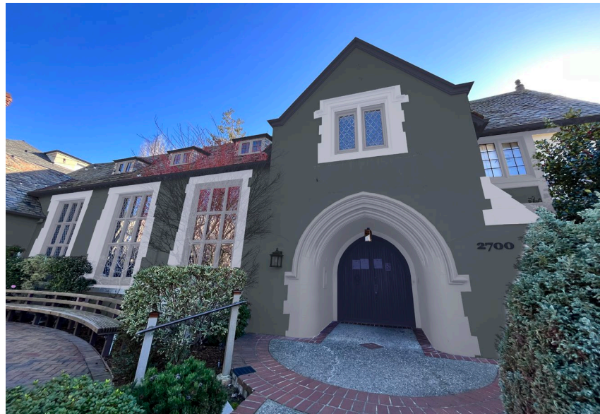
EXTERIOR STREET VIEW HERITAGE HOUSE SCHEME C