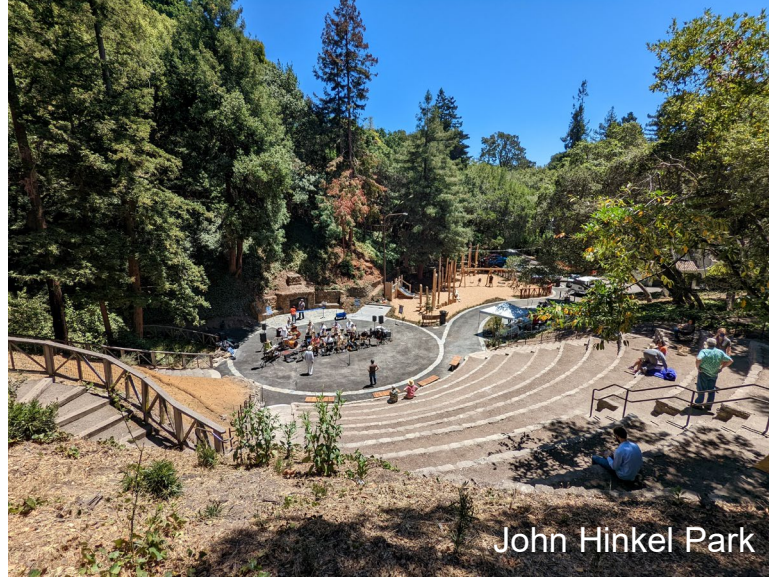
John Hinkel Park