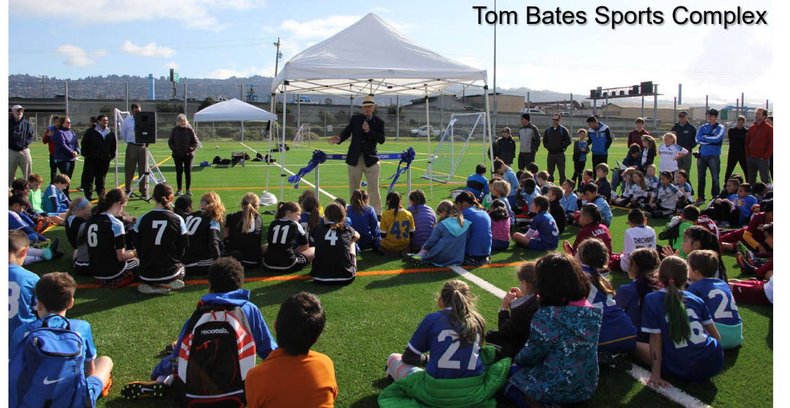
Tom Bates Sports Complex