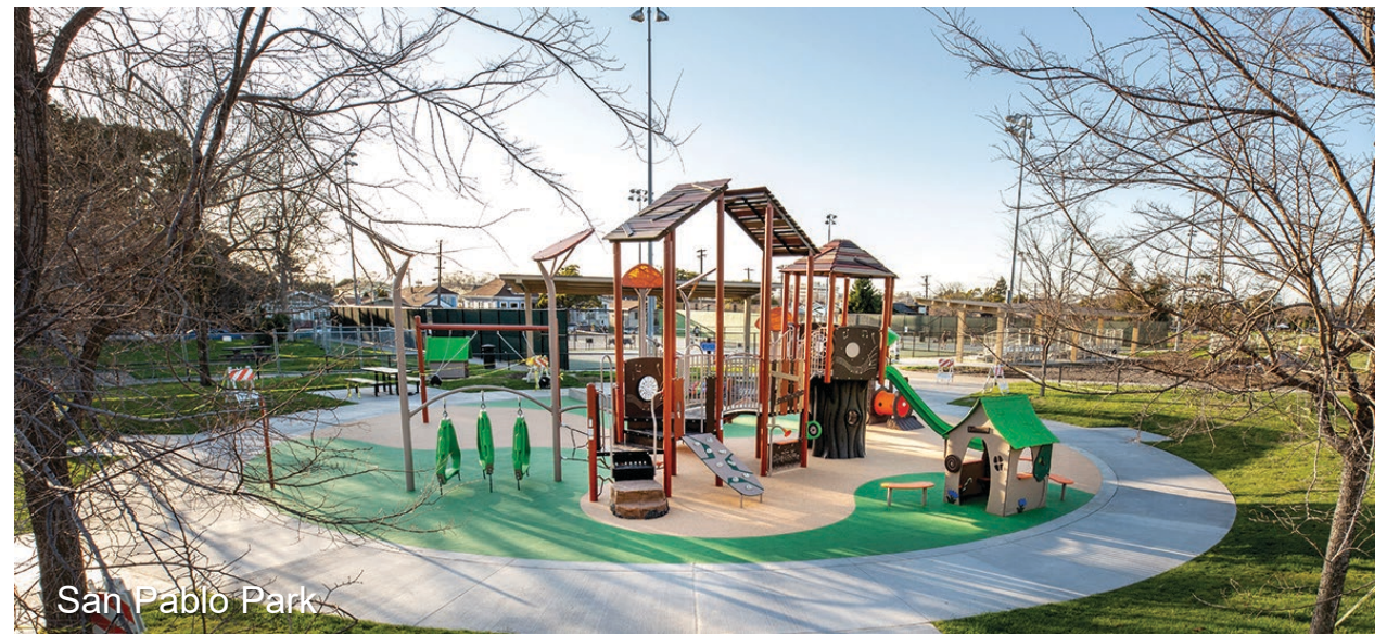
San Pablo Park