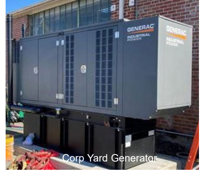
Corp Yard Generator