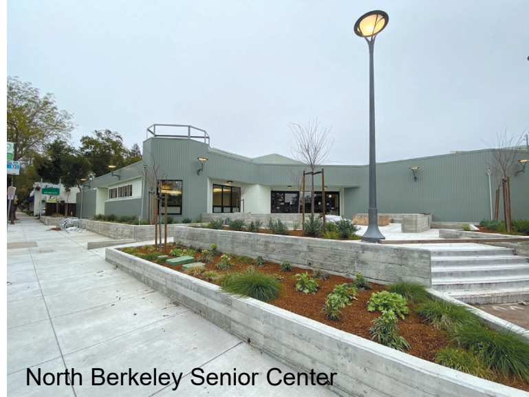
North Berkeley Senior Center