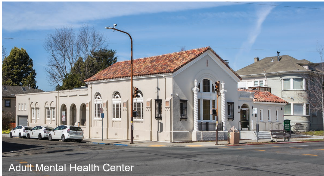
Adult Mental Health Center