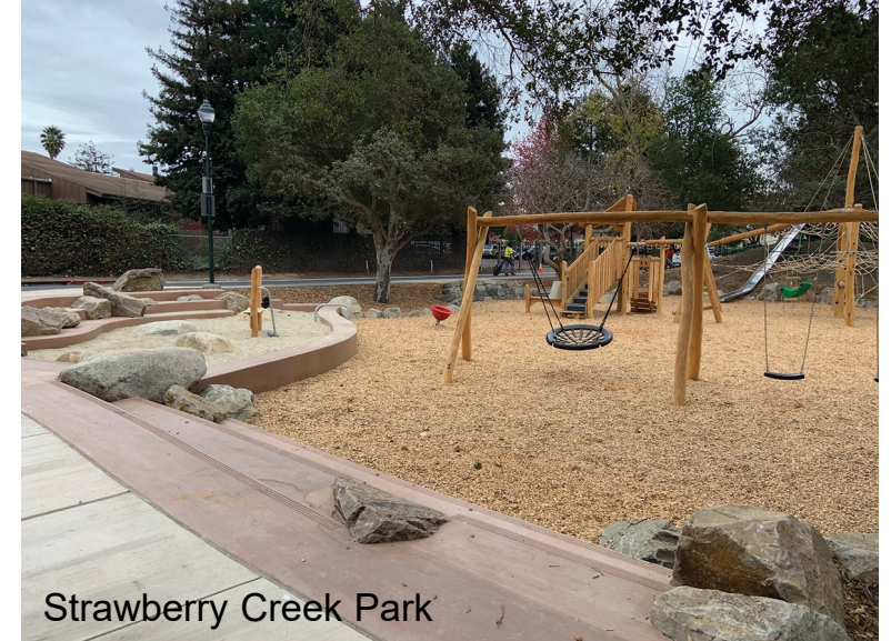
Strawberry Creek Park