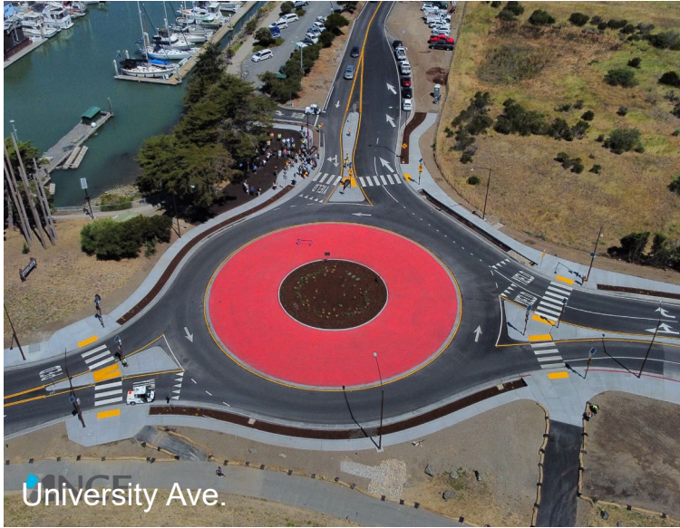
UNCE University Ave.