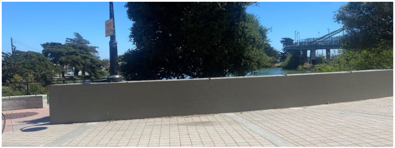
Wall dimensions are approximately 42.5' long x 3.5' high x 2' deep.