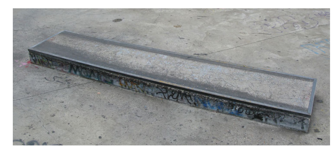
CURB SIZED LEDGES