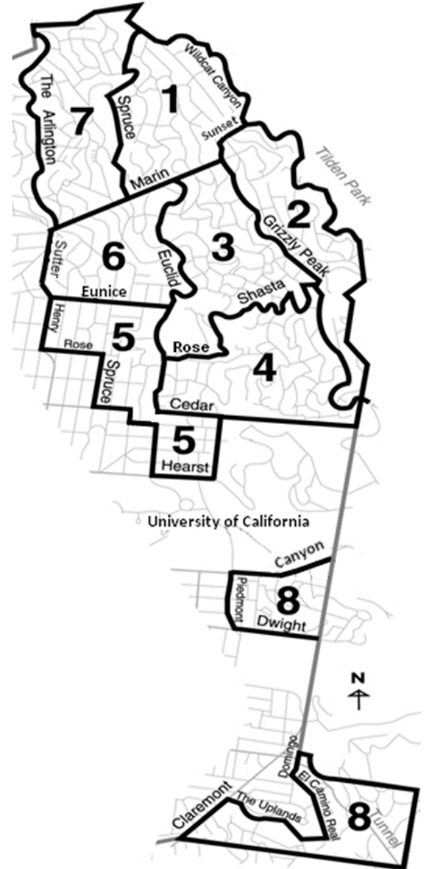
2022 Fire Fuel Chipper Program & Vegetation Debris Bin Program

To find out what area you are in, go to: www.cityofberkeley.info/fire_fuel_program click on ArcGIS Interactive Map and type in your home address.