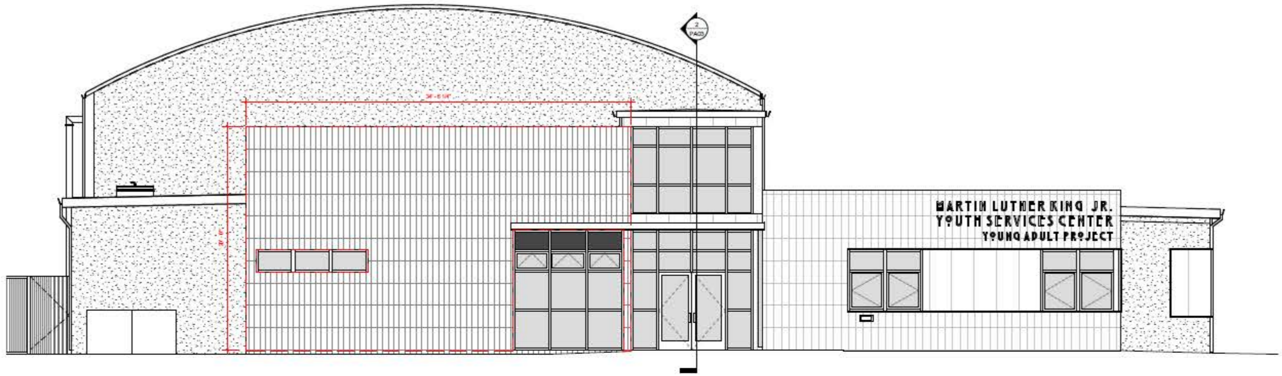
3 EAST ELEVATION 1/4" = 1'-0"