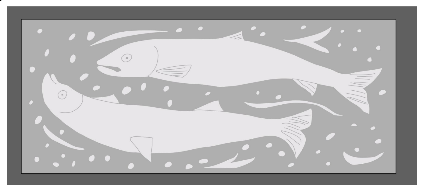
Bench imagery design layout