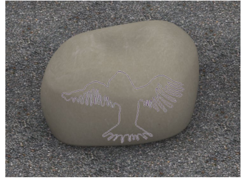
Grinding rock design with condor imagery