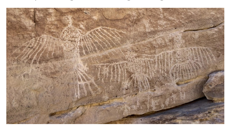
Example image of condor glyph