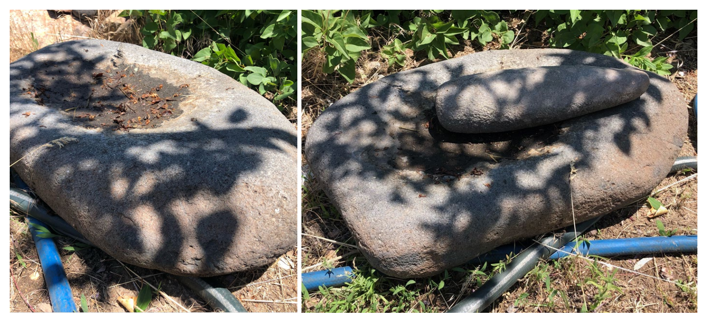
Example image of Jean's grinding rock