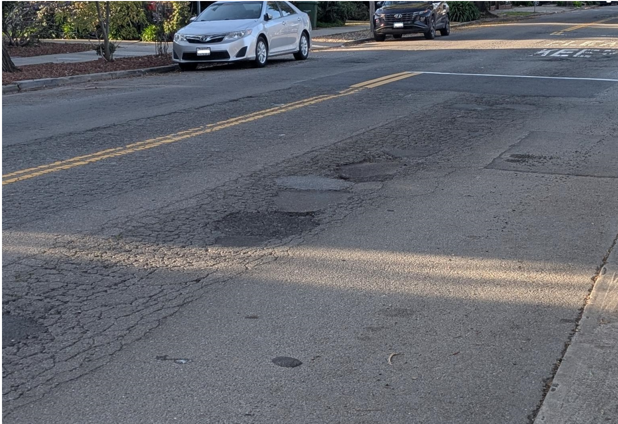
Exhibit 2: A Segment of Hopkins Street between Gilman and Sacramento with a PCI of 19, indicating a failing pavement condition