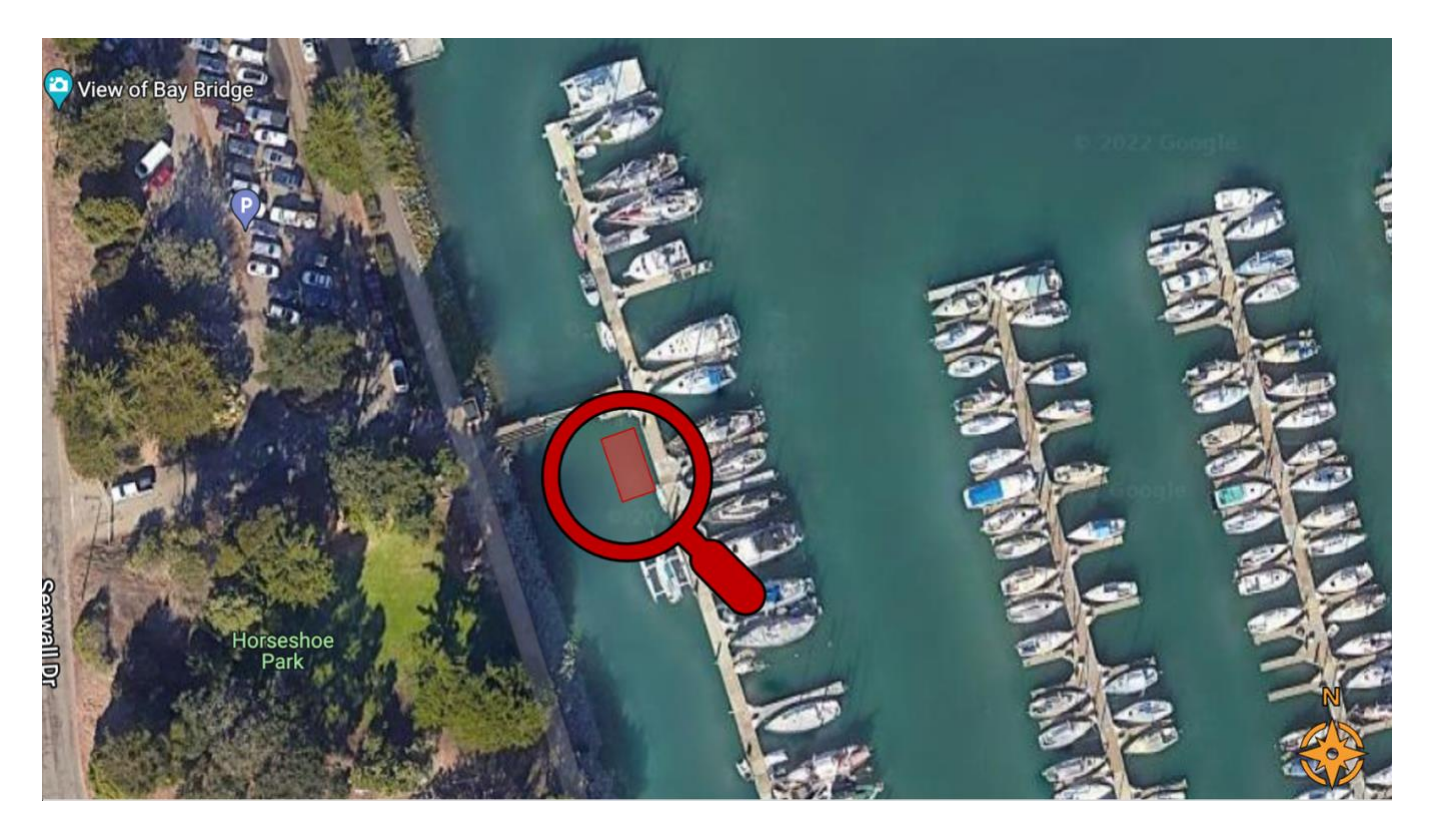
Figure 1. Aerial view of the location for the proposed berth site on the West side of the N dock.