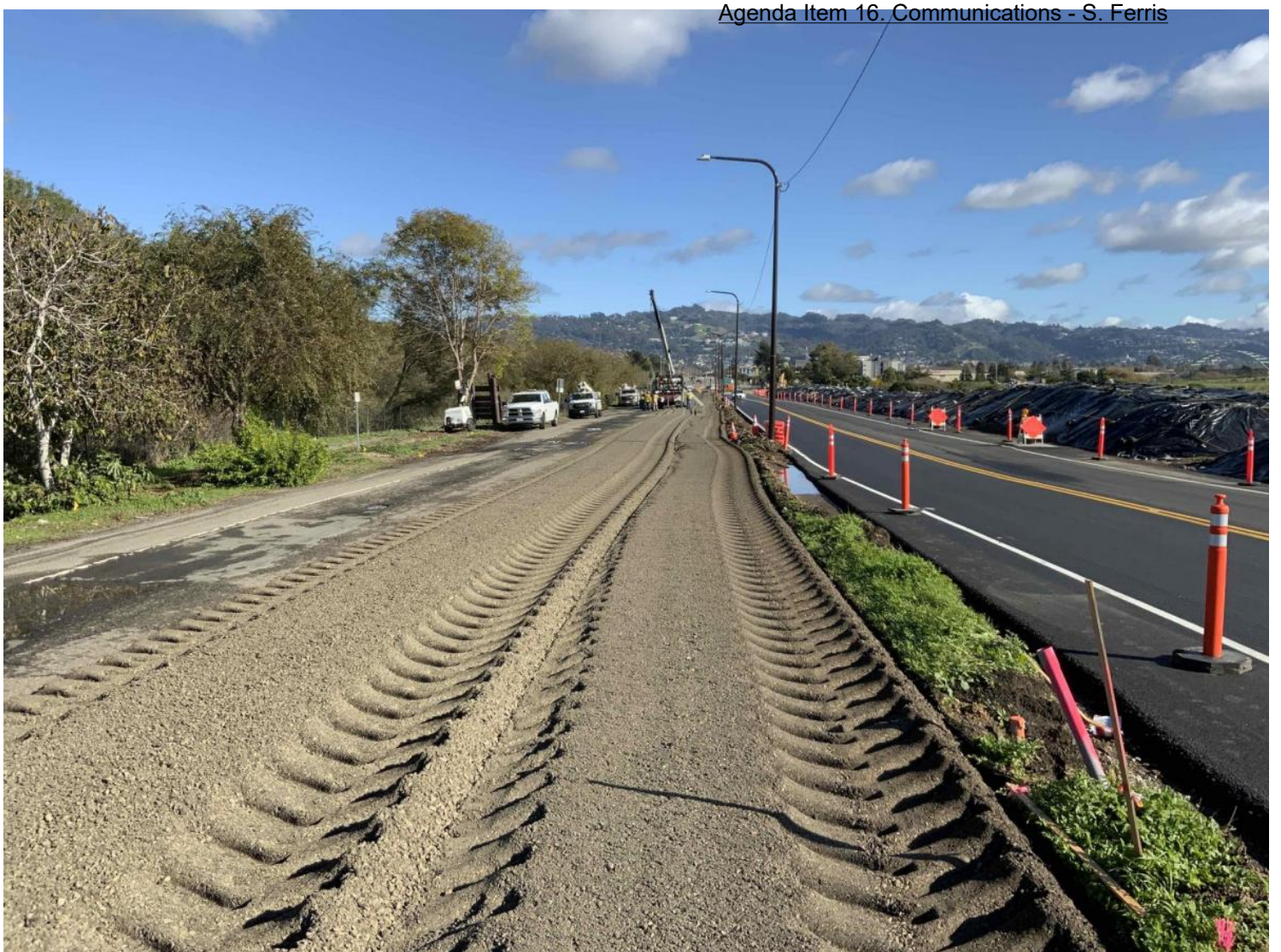
Berkeley moved travel lanes off the old pier extension and turned the former roadway into a green space as part of its Marina streets project.

There were multiple attempts to repair the streets in the past. All of them failed due to what was under the road: a filled-in pier extension. No matter what the city did, the roadway kept shifting and sinking in between the pier caps, creating a series of unpleasant bumps. The roads were also at different heights, which resulted in chronic drainage problems.