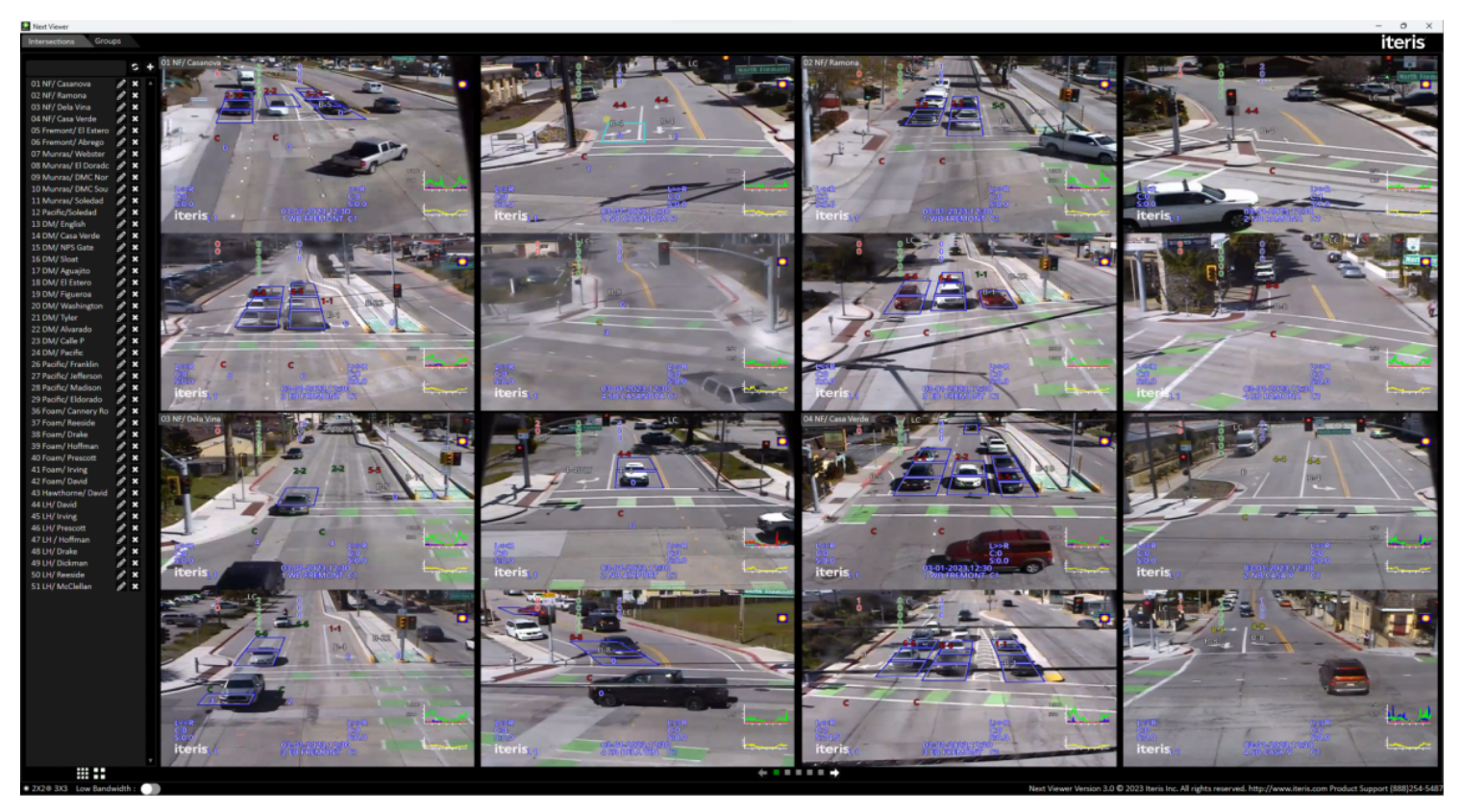
Monterey's adaptive traffic system adjusts individual signals to move groups of vehicles through a corridor with few or no stops.

The project also received top marks from the Northern California Chapter of the American Public Works Association, which awarded it the Best Project of the Year and Best Project Between $5 and $25 million awards for 2022.