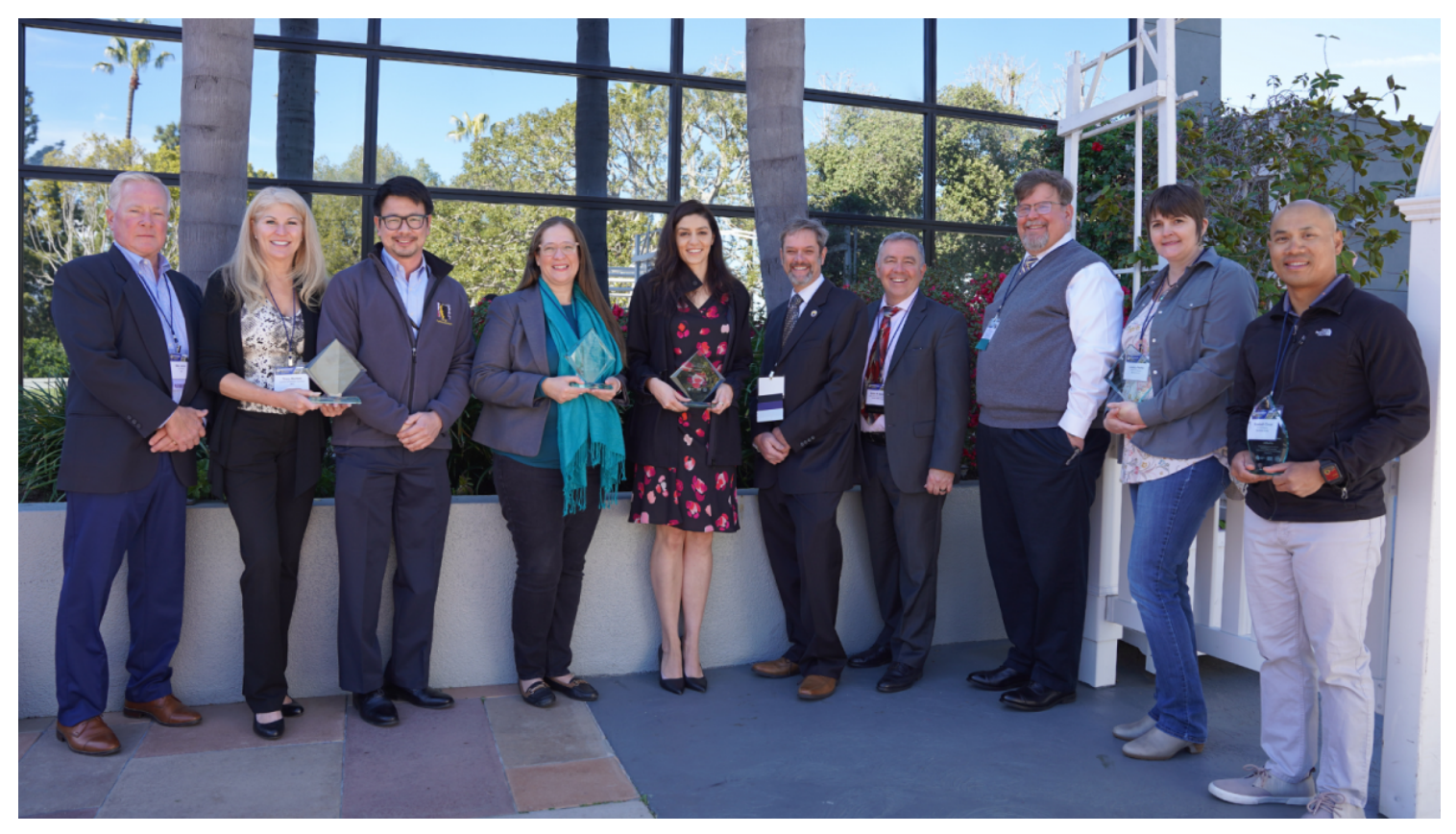
City and county public works officials accepted their 2023 Outstanding Local Streets and Roads Project Awards at the Cal Cities and CEAC Public Works Officers Institute in Universal City.

city's Neighborhood Community Improvement Program, Monterey Bay Air Resources District and Regional Surface Transportation Program grants, and a special transportation tax measure.