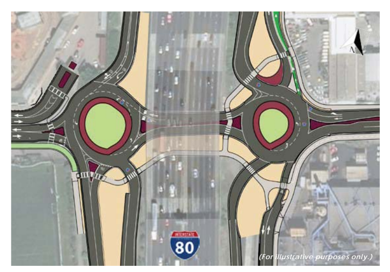
Overlay of the roundabouts at the project location.