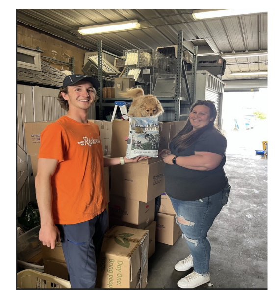
Pet supplies including unused kitty litter, pet food and toys