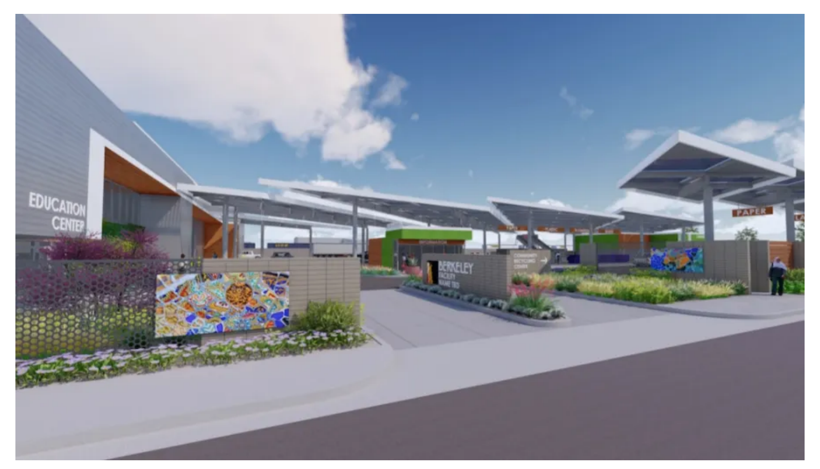
A 2019 rendering shows what Berkeley's waste facility could look like, included in a report outlining three possible visions for the center.

The city is also phasing out two container sizes for residences, 13- and 45-gallon, which the manufacturer no longer makes. The Zero Waste Division's vehicles' automated arms cannot hoist those sizes.