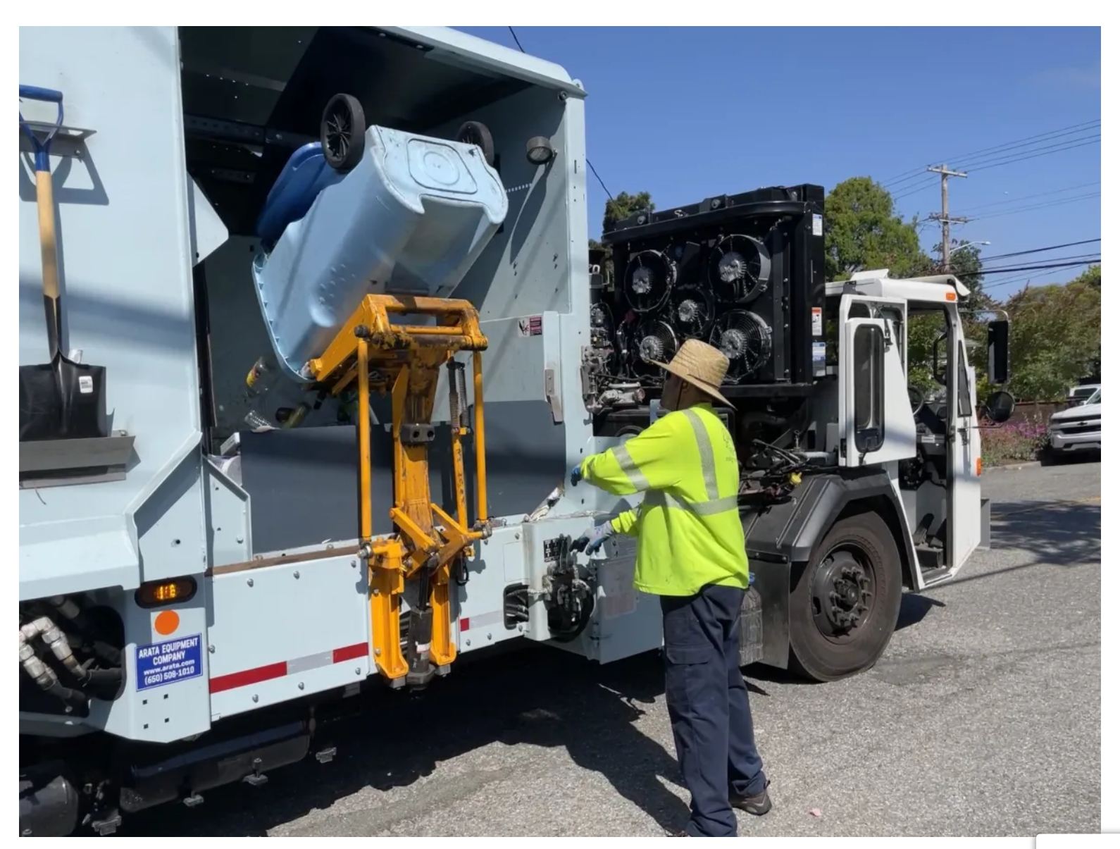
The Berkeley City Council approved a five-year incremental rate hike for residential waste pickup Tuesday, June 27, 2023