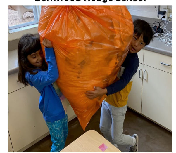
Collection of plastic film in support of school fundraiser