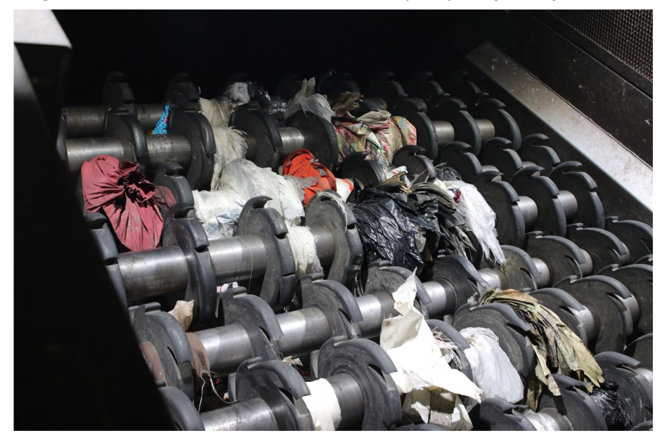
Before we will include any item in our service we <u>FIRST</u> make sure that a vetted and trusted reuse or recycling partner exists