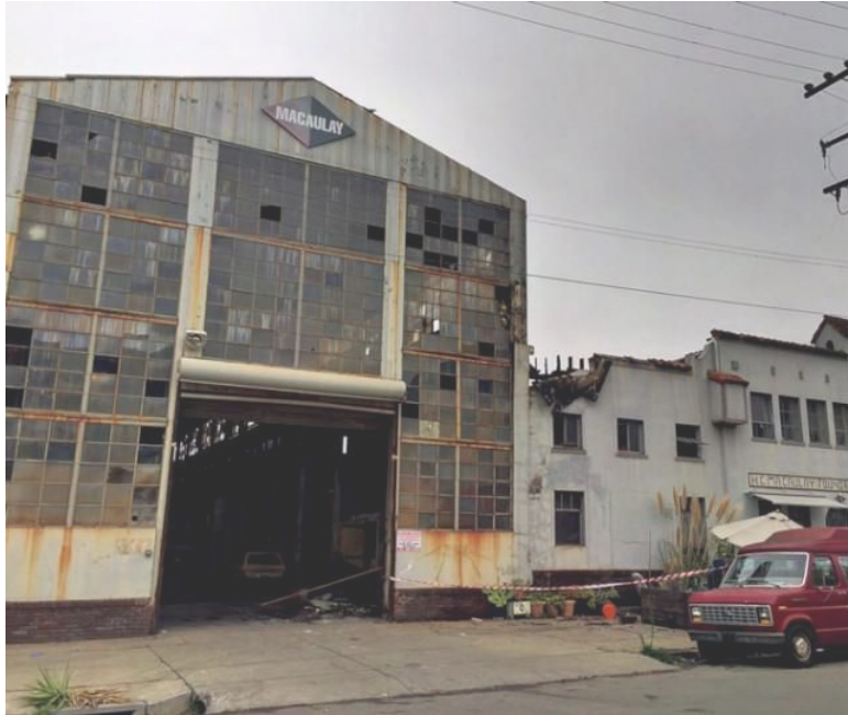
Macaulay Foundry