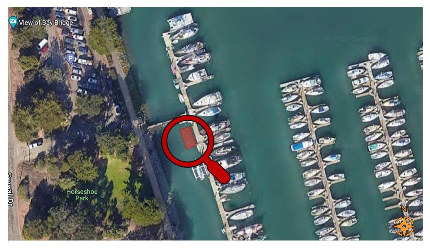
Figure 1. Aerial view of the location for the proposed berth site on the West side of the N dock.